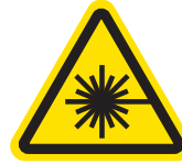
Laser radiation warning