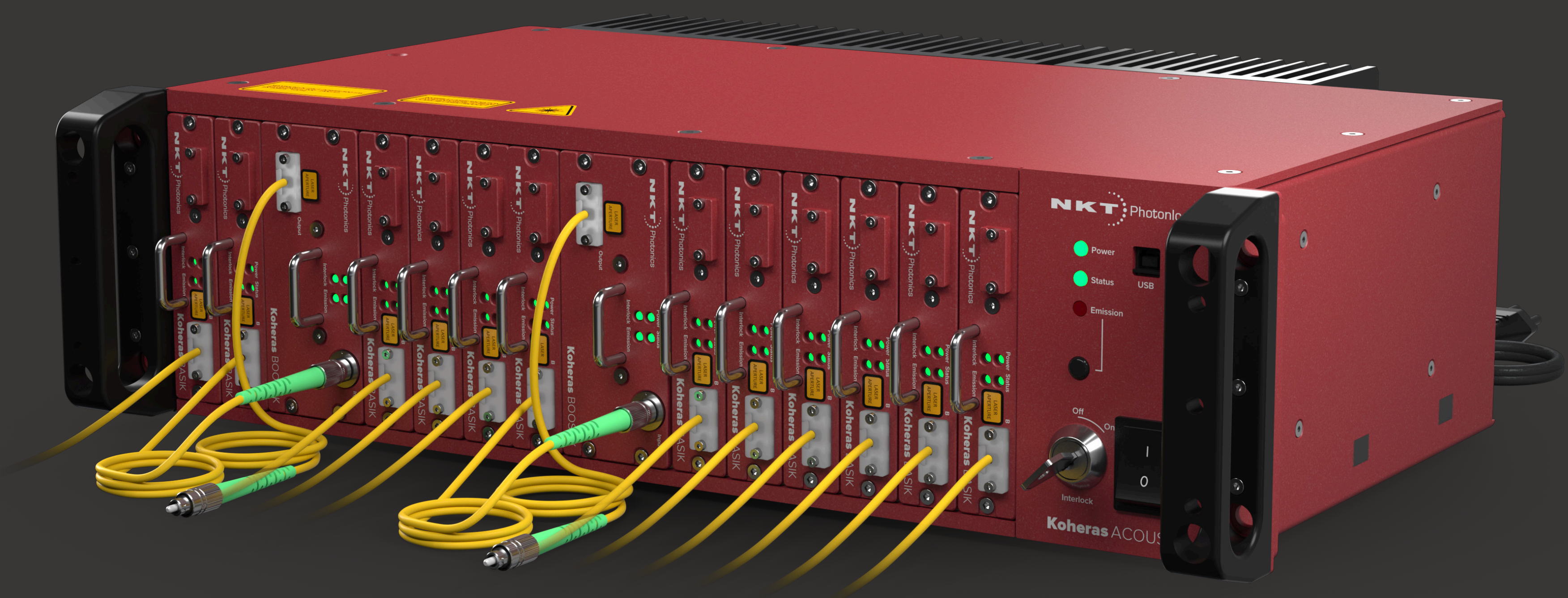
Koheras ACOUSTIK system.

The amplifier module occupies two slots in the Koheras ACOUSTIK system.